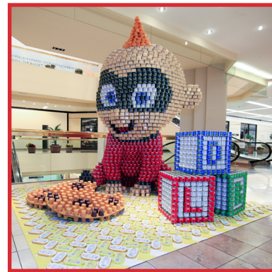
2018 Best Original Design "We CAN Make an Incredible Difference" Disneyland Resort | Design & Engineering