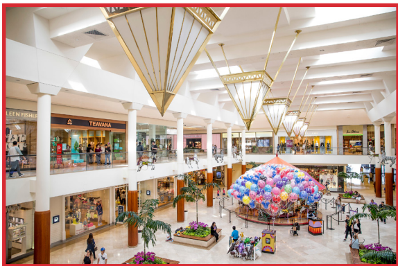
South Coast Plaza (in conjunction with the Festival of Children)